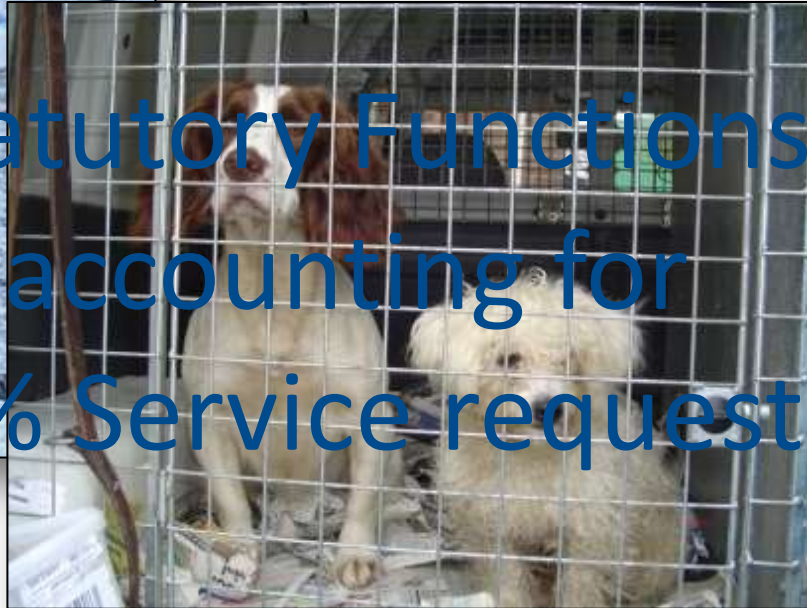
Animals & Licensing

Statutory Functions accounting for 85% Service requests